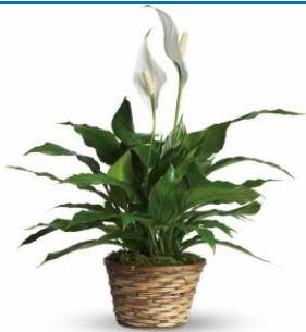
The Peace Lily: Spathiphyllum

The peace lily has attractive, dark green, lush foliage and a compact habit and is one of the most popular indoor plants grown in homes and offices. They are hardy, low maintenance plants that can help improve indoor air quality and have beautiful, tall white flowers throughout the year.