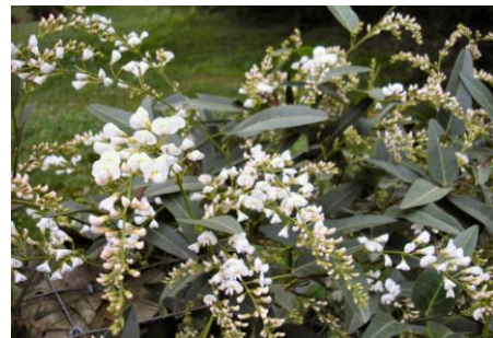
Hardenbergia 'Alba' - a pure white