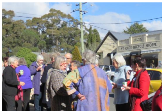
Morning tea in the sunshine