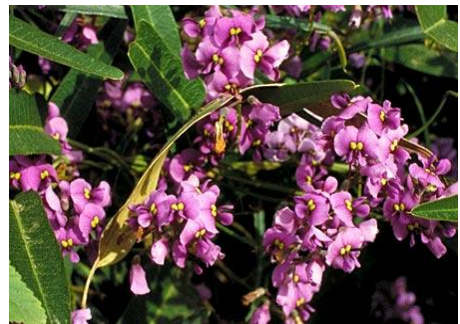
Hardenbergia 'Rosea' - a soft pink