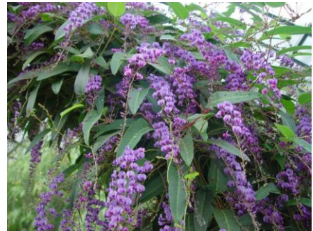
Hardenbergia violacea 'Happy Wanderer'