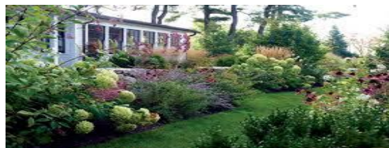
Our Garden Club supports this annual event.