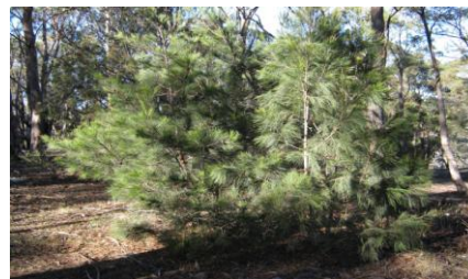
Allocasuarina littoralis (black she-oak)

Propagation of an additional 700 plants is underway and they will be ready for planting out in June/July at which time another 150 trees will be planted at the oval and its surrounds. NPWS will also be planting in Morton National Park, Bungonia National Park and Cecil Hoskins Nature Reserve.