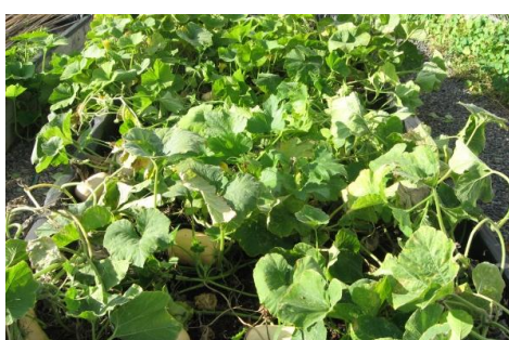
Removing the bean wigwams allows the butternut squash to spread out.