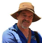
Our Invited Guest Speaker