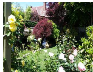
Cowper Street Garden