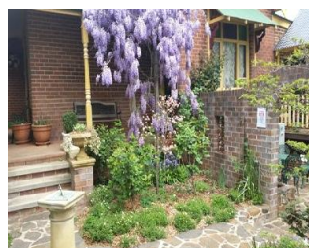
Kialla Street Garden

Bring your own lunch or visit a local cafe, then stroll through Garden Lovers Shopping Alley where an extremely interesting array of plants, artisan garden art, beautiful botanical artwork, obelisks and plant supports can be purchased for your garden.