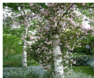
House of Peace Garden