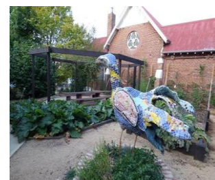
Willow Tree Sculpture Garden