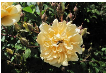
The Crepuscule Rose

**Crépuscule is a reliable, strong rose bred by Francis Dubreuil in France in 1904. It is classified as a Noisette, one of the Old Garden Rose categories. Flowering throughout the season in decorative small clusters, Crépuscule creates a beautiful rose display with intense, sweet, musk old rose fragrance. It can grow into a very large tall shrub rose up to 4m high and 2 to 4m wide. It is also capable of a semi-climbing habit and can be trained against a trellis or along a fence. This cultivar is also used as a large ornamental weeping rose and can create a magnificent display of roses on arching canes. Crépuscule is orange, fading to apricot-yellow; the name is French for "twilight", very apt given its colour reminiscent of sunset.